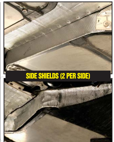
SIDE SHIELDS (2 PER SIDE)

FOR MORE INFORMATION AND OUR COMPLETE PRODUCT LINE GO TO