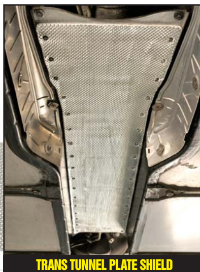
TRANS TUNNEL PLATE SHIELD