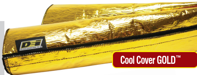
Cool Cover GOLD™