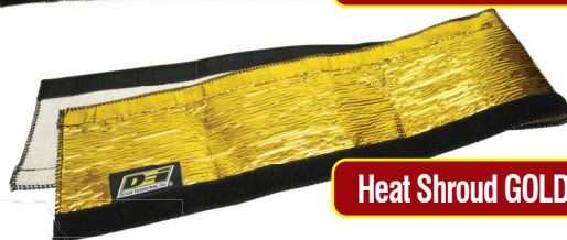
Heat Shroud GOLD™