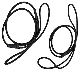
2 EXTENSION STRAPS