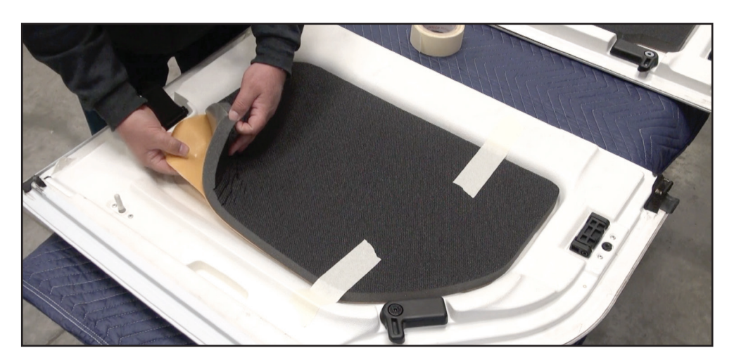
FIG. 5 Allign piece in freedom top and use a mild tape to temporarily hold in place.

6.) Peel off backing at one end of the freedom top piece and adhere to the top. Use slight pressure to stick it down. This will hold the piece in place. Fig 6