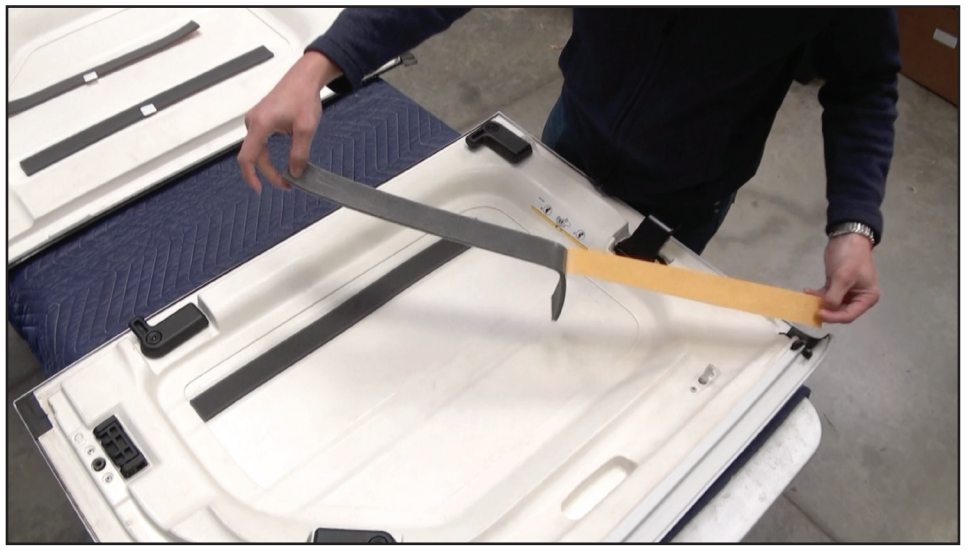
FIG. 4 Peel the backing off filler strips and place into grooves.

IMPORTANT: DO NOT stretch filler strips when placing them on the top. Let them naturally lay into groves.