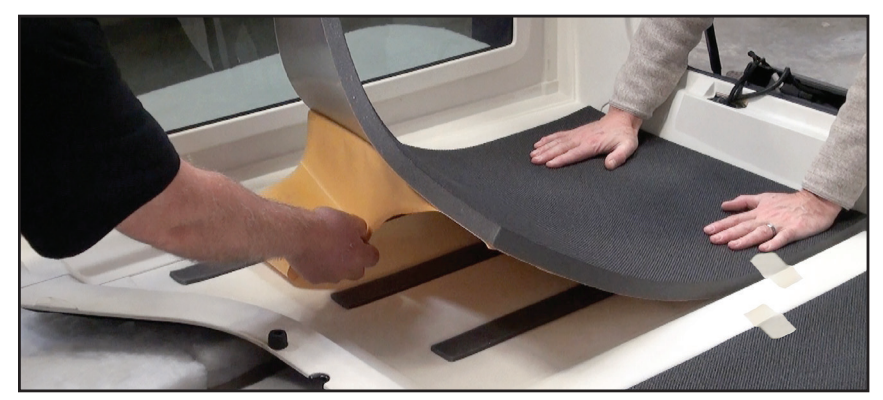
FIG. 10 Peel back a small section of release liner start to adhere the piece to the top. Continue to pull the release liner off and gently press piece in place