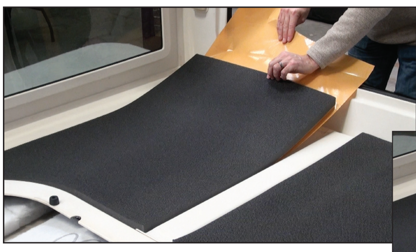
FIG. 11 & Fig 12 Slowly pull the release liner off as you press the piece into place. NOTE: Use gentle pressure. DO NOT use a lot of pressure when pressing piece into place.