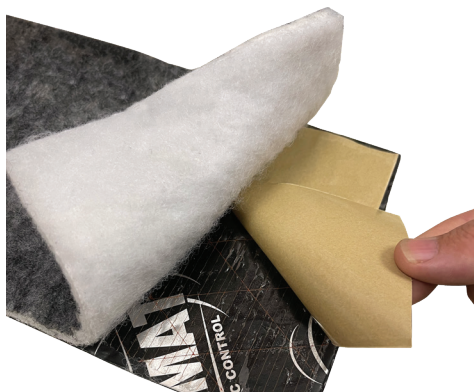
FIG. 4 Install strips of adhesive Transfer Tape to the floor pan where needed to hold Under Carpet Lite insulation in place. The placement is not critical. Just apply to areas to hold insulation in place. Once applied, peel back liner of tape and press Under Carpet Lite Insulation in place.