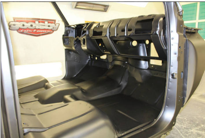
FIG. 1 Remove seats, console & carpet. Clean dirt/debris and recommend using sealer on any rust spots (View from passenger side)

NOTE: Low center hump truck shown in photos.