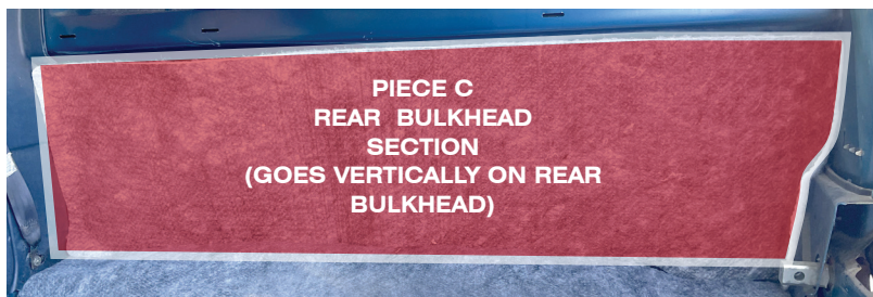
FIG. 3 Test fit all pieces in place. Mark & cut all mounting holes needed (View from driver side) (Photo for illustration purposes only)

STEP 4. Install your carpet back in place over the new insulation. Reinstall the rest of the interior.