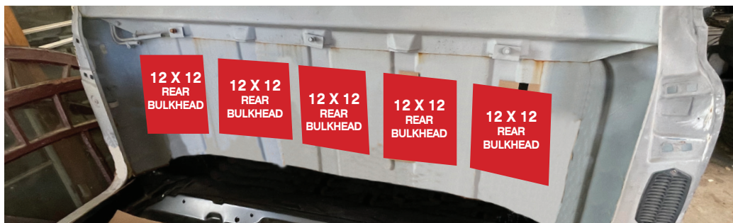
FIG. 3 Rear Bulkhead Install damping material in these approximate locations. The perfect placement is not critical. But good adhesion is key. Make sure to press material in place with roller to ensure good adhesion. (View from driver side door)

NOTE: You will have extra 2" wide damping tape left over. Use it in any other areas you feel might need some.