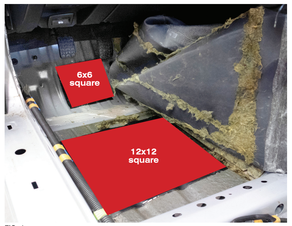
FIG. 1 RECOMMEDNED LOCATIONS TO PLACE BOOM MAT DAMPING MATERIAL IN DRIVER AND PASSENGER FOOT WELL AND UNDER SEAT DRIVER SIDE SHOWN (VIEW FROM DRIVERS DOOR)

STEP 3. In the foot wells you will use a 6" x 6" square in the front and two 12" x 12" squares, one in front of the seat and one under the seat for each side.