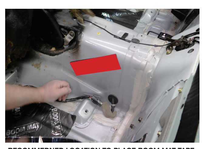
RECOMMEDNED LOCATION TO PLACE BOOM MAT TAPE DAMPING MATERIAL ON DRIVER SIDE TRANS TUNNEL DRIVER SIDE SHOWN (VIEW FROM DRIVERS DOOR)