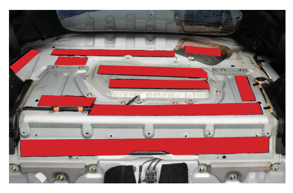
FIG. 1 RECOMMEDNED LOCATIONS TO PLACE STRIPS OF BOOM MAT DAMPING MATERIAL TAPE

OVERVIEW: This kit controls noise and vibration on 1990-2005 Mazda Miata NA & NB models