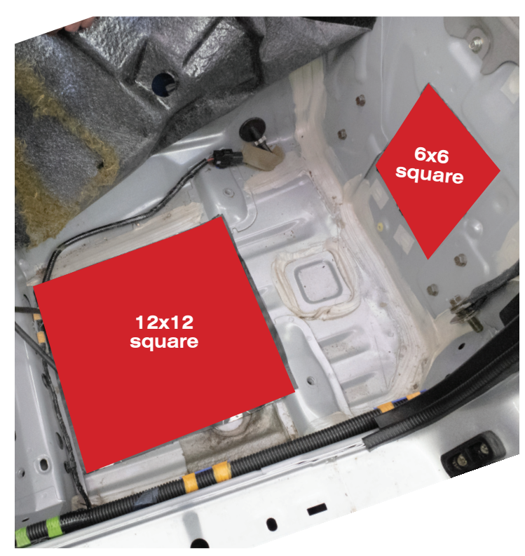
RECOMMEDNED LOCATION TO PLACE BOOM MAT DAMPING MATERIAL UNDER THE SEAT AND BEHIND DRIVER AND PASSENGER SEAT DRIVER SIDE SHOWN (VIEW FROM DRIVERS DOOR)

STEP 5. Reinstall carpet, panels and seats in the reverse order following the manufacturer's recommend torque settings.