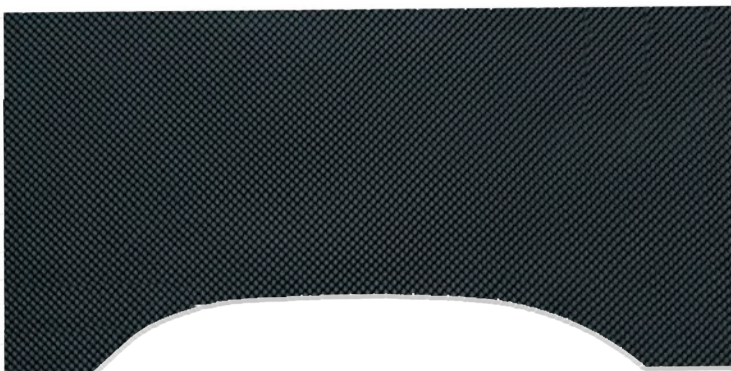
Fig 2 (Main Shield)