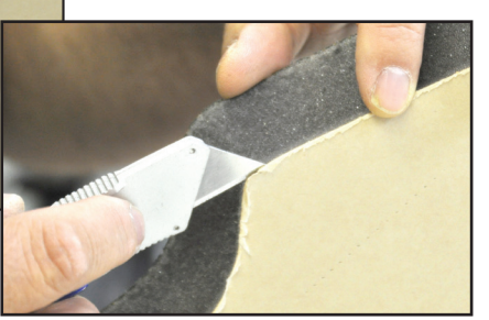
It helps to use a utility knife to gently separate the paper liner from the adhesive backing

4.) Remove one edge of the paper release liner from the back of the part about to be installed. (Figure 4)