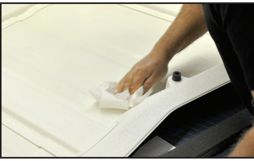
Figure 1 – Hardtop removed and inverted

1.) Remove the hardtop from vehicle following the manufacturer's suggested removal. Placing the hardtop on a blanket is recommended to protect it from scratches. Make sure to place the hardtop on the blanket in an inverted position.