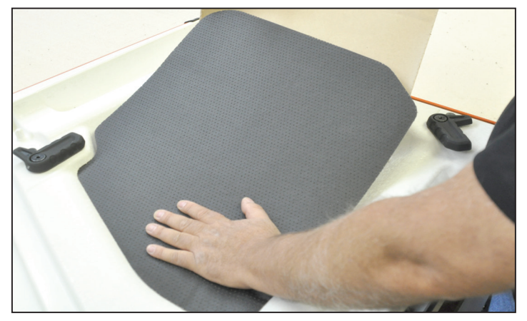
Figure 5. Lay panel in place by applying gentle pressure