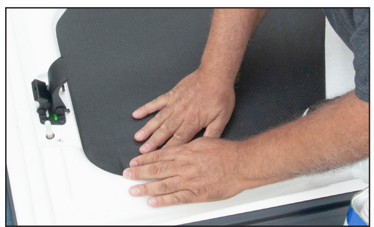
Figure 6. Apply pressure by hand for proper adhesion

5.) Once the starting edge is adhered, lay down the rest of the part while pulling the backer liner off while applying gentle pressure by hand as shown in Figure 5.