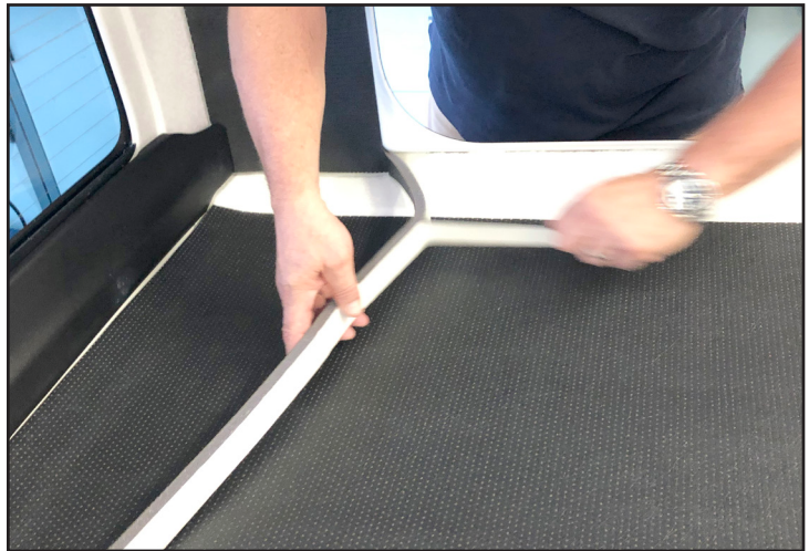
Figure 11. Peel the rest of the release liner off narrow section and press into place.

11.) Reinstall the hardtop according to the manufacturer's suggested installation.