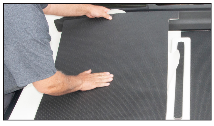
Figure 9. Pull backer off while applying gentle pressure