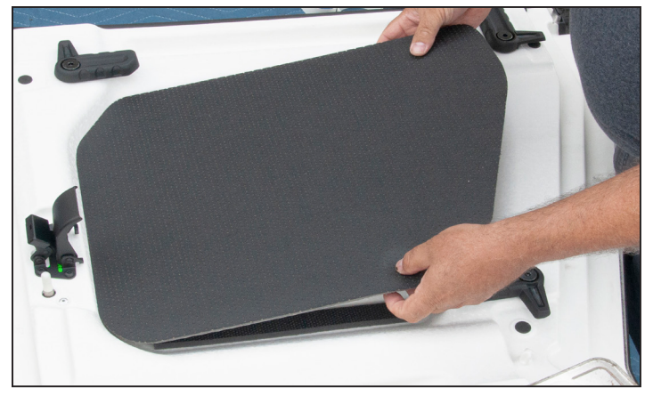
Figure 5. Lay panel in place by applying gentle pressure

5.) Once the starting edge is adhered, lay down the rest of the part while pulling the backer liner off while applying gentle pressure by hand as shown in Figure 5.