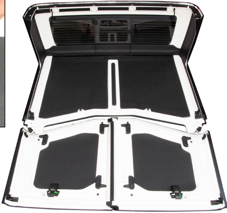
Completed installation with top inverted