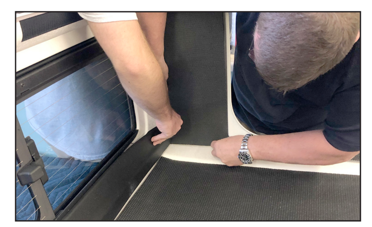
Figure 10. Pull small portion of release liner and line up large section

9.) Locate the side window liners. The release liner is slit to help in installation. Peel a two inch portion of the release liner away from the wider portion of the liner. Have someone hold the black trim away from the top and then slide the liner into place making sure to align with the edge of the top. (Figure 10) Once in place remove the rest of the release liner and stick into place. Then remove the release liner from the narrow strip and stick in place being careful not to stretch the foam. (Figure 11) Repeat for other side.