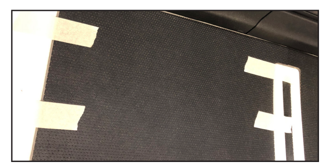
Figure 7. Tape rear section into place

7.) Once the parts have been installed, apply pressure by hand. (Figure 6)