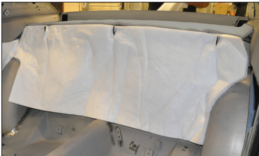
Fig 2 The insulation will hang in place and be held in tightly by the back seat.

STEP 5. Some trimming may be needed as different cars and model years may have slight variations to the pattern.