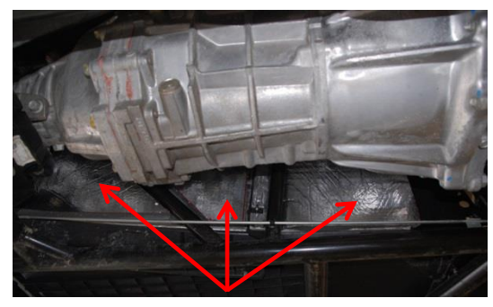
Figure 4a Driver side