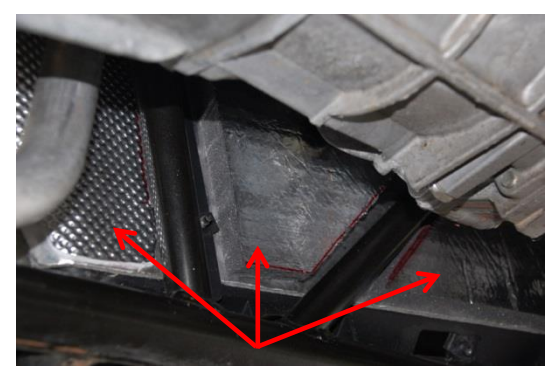
Figure 4b Passenger side