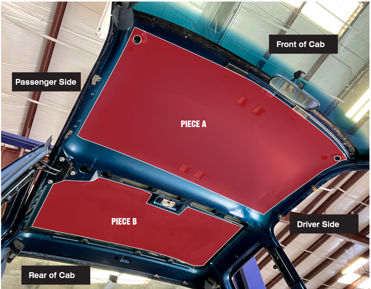
FIG. 2 Install insulation material as shown in image. Piece a is for the front cab section with the rounded edge and holes going toward the windshield. Piece B is for the extended cab section with the notched out area going around the dome light.