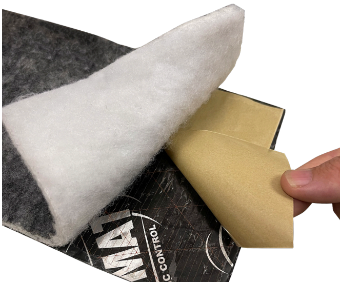
FIG. 3 Install strips of adhesive Transfer Tape to the floor pan where needed to hold Under Carpet Lite insulation in place. The placement is not critical. Just apply to areas to hold insulation in place. Once applied, peel back liner of tape and press Under Carpet Lite Insulation in place.

STEP 3. Reinstall your headliner & any overhead console according to the manufacturer's instructions.