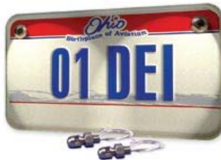
LED License Plate & Accent Lighting